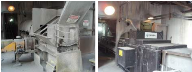
Lafarge Whitehall analyzer location before and after installation

To improve the raw mix control Lafarge Whitehall decided to implement an online raw-mix control strategy using a SABIA on-belt elemental analyzer in conjunction with the company's proprietary raw-mix-control software.